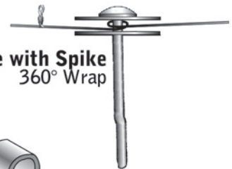
Double Plate with Spike 360° Wrap