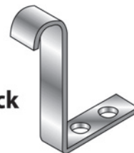
Storm-Lock Side Clip