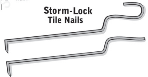
Storm-Lock Tile Nails